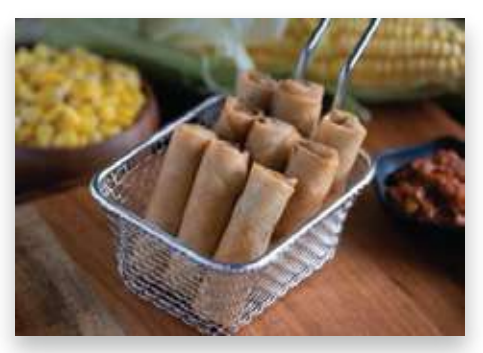
Corn Spring Roll